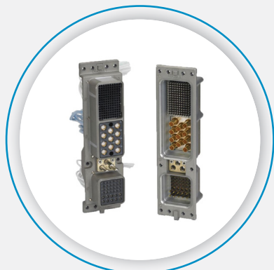
Arinc 600 size 2 receptacle populated with selective plating size 22 contacts