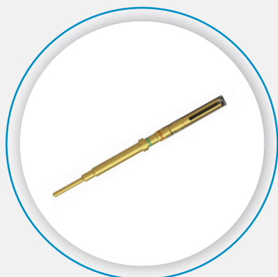
#22 PC tail socket contacts with selective plating

To address the aerospace market challenges, strong competition and regulations, Radiall designed a new generation of contacts for Arinc 600 connectors. Fully integrated to its latest generation of Arinc 600 connectors, this option offers up to 10% cost savings while being fully qualified under the Arinc 600 standard.